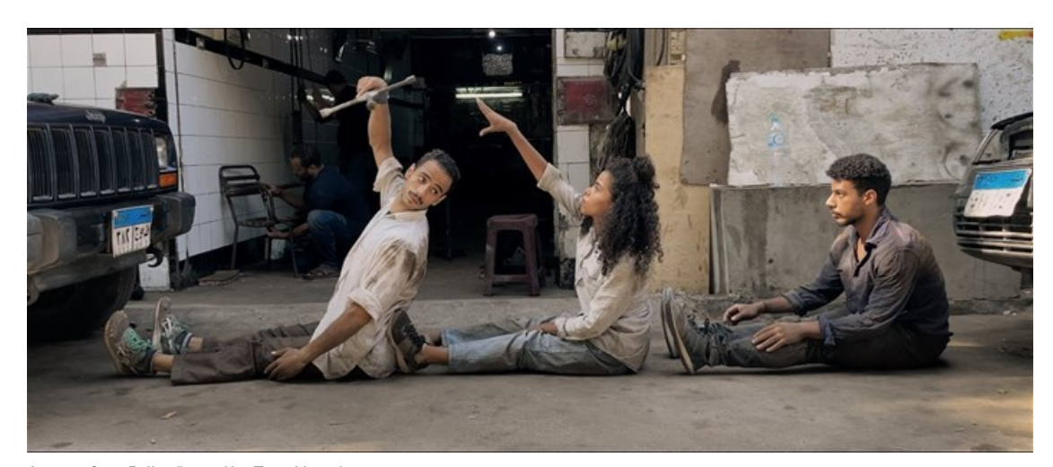
A scene from Belia, directed by Eman Hussein

The festival, primarily virtual, has a live component with short films screening for free across the City of Durban and KwaZulu-Natal at four different venues this year: Alliance Française, KZNSA Gallery and Daily Dosage in Durban and Luthuli Museum in Groutville.