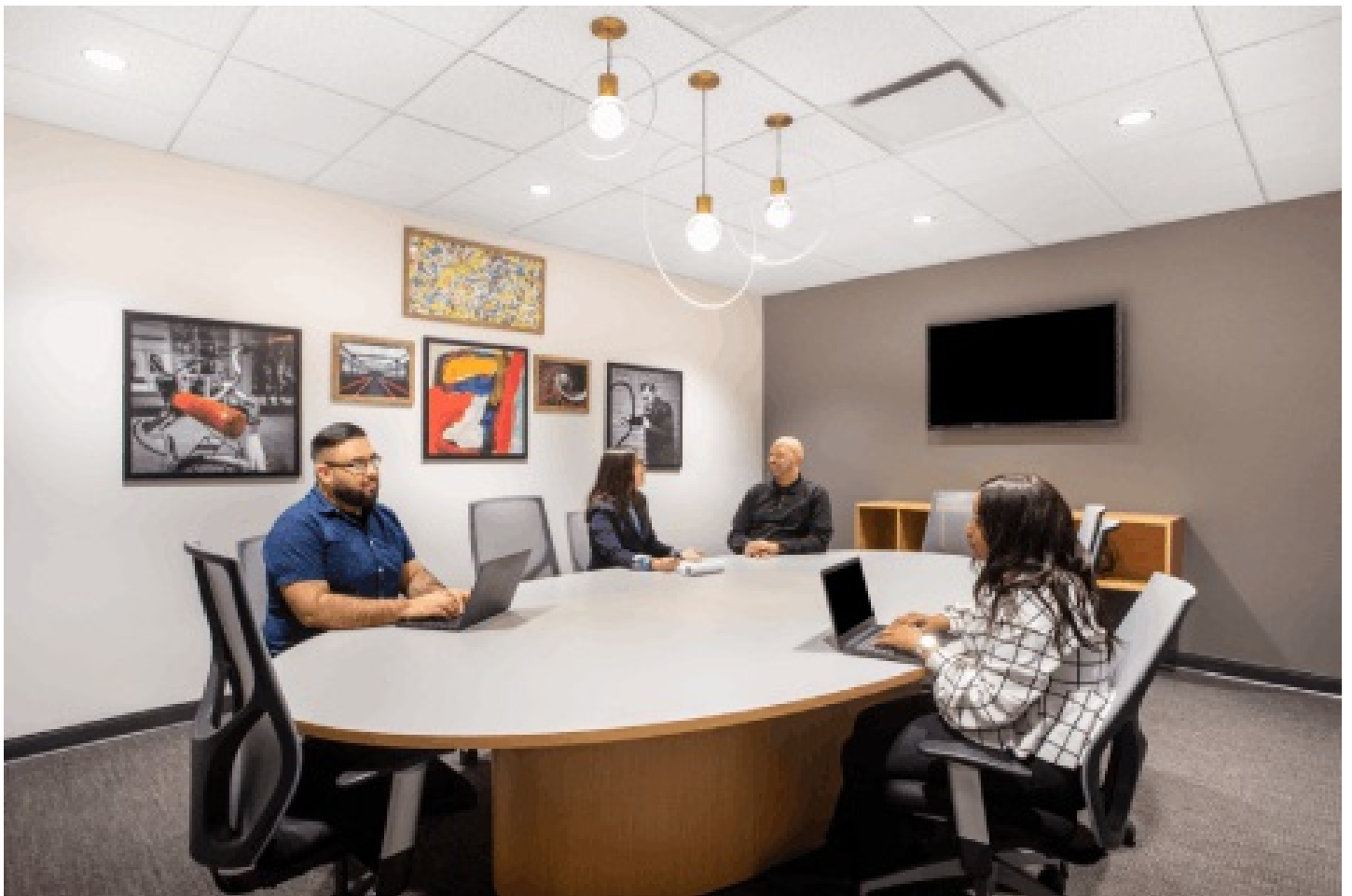
Ahead of the curve