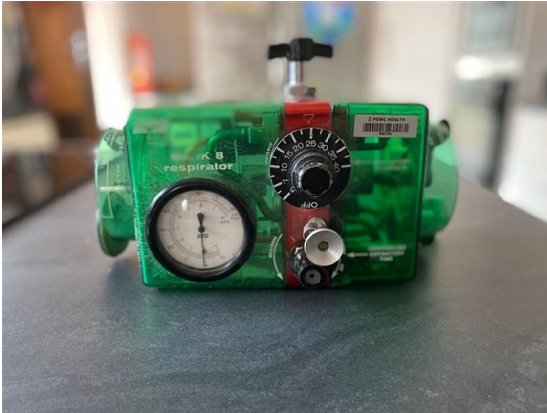
An existing mechanical respirator being reverse-engineered to be used as an emergency ventilator.

The world, and now more recently our nation, is faced with difficult times as the recent Covid-19 pandemic turns life as we know it upside down. A team at the Faculty of Engineering from the North-West University (NWU), in collaboration with other experts involved in this unsettling battle, is rising to the challenge to support our government in its fight against the Covid-19 pandemic.