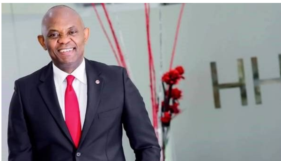
Tony Elumelu, entrepreneur, investor and philanthropist

The Tony Elumelu Foundation (TEF), a philanthropy empowering young African entrepreneurs across all 54 African countries, has opened applications for the 2022 TEF Entrepreneurship Programme. African entrepreneurs with business ideas or existing businesses under five years are encouraged to apply now for $5,000 seed capital, mentorship, business management training and more on the 2022 Tony Elumelu Foundation Entrepreneurship Programme