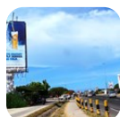
'Frozen' Castle Lite billboard in Tanzania sends chills

Castle Lite has gradually built equity around concerts and music. They could have easily spent millions and probably billions talking about their light beer, but instead, they sought to create experiences that would enable people to enjoy their beer, create positive associations with the brand and also strengthen their unique memory structures. These in no particular order would be; 'unlock', 'refreshment', 'ice cold', 'the visualisation of ice', 'the ice-cold indicator', 'extra cold', 'concerts' and 'music'.