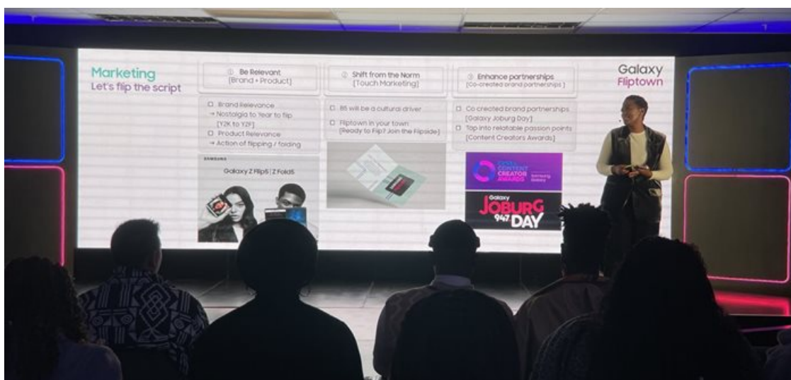
Samsung South Africa Galaxy Z Flip5 brand positioning.

"We welcome the competition because it brings more legitimacy to the foldables category," concludes Hume.