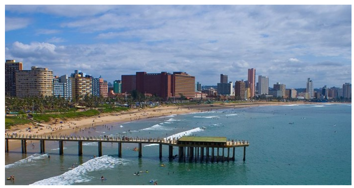
Steve Roetz via Wikimedia Commons

No matter what time of year it is, those visiting Durban will face the unanticipated wave of heat and humidity along the shores. With many businesses moving out of the old city centre to Umhlanga and beyond, business travellers are able to enjoy the pristine beaches that used to be the haunts of locals only. Leading beach spots include North and South Beach, Bay of Plenty, and Umhlanga Beach, or explore some of the lesser visited locations which make up the seemingly endless stretches of sandy beaches.