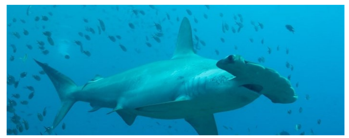
Shark Side of the Moon