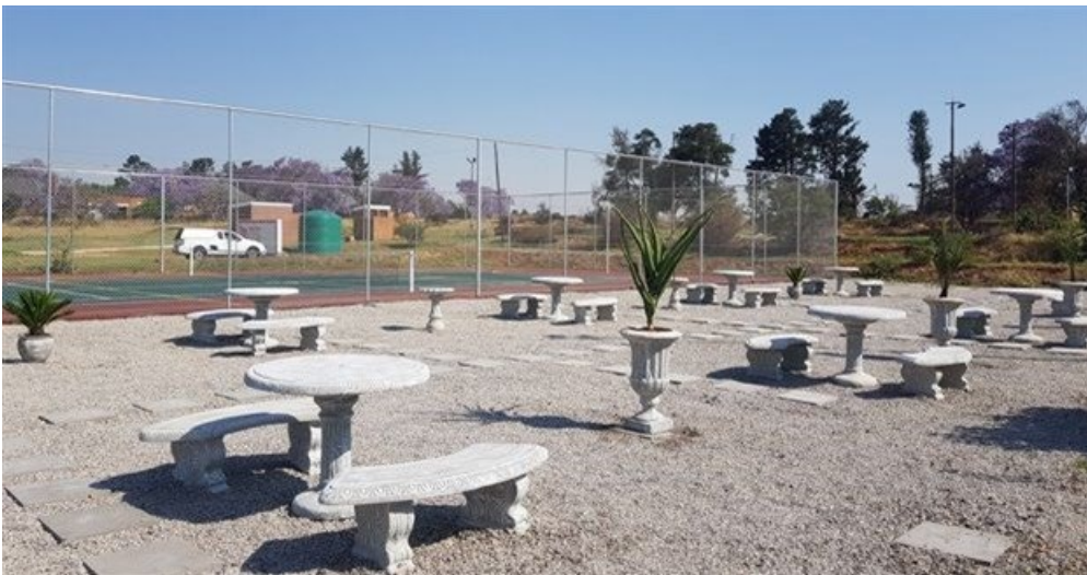
New recreational area

Speaking about the importance of investing in mental healthcare, Pols says: “In the wake of the Life Esidimeni tragedy, the importance of having a strategic focus on improving healthcare services to vulnerable groups such as the mentally ill cannot be underestimated. At the hearings of the South African Human Rights Commission, it was stated that mortality rates of people with mental illness are 2.5 times higher than that of the general population. This shows the immense need for specialised facilities such as Sterkfontein Hospital.”