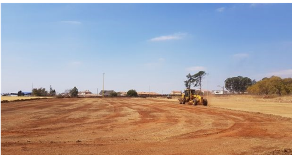
Soccer field before

Since the launch, the hospital has received complete upgrades and furnishings of its occupational therapy library and media centre, restaurant, kitchen, and tuckshop. A new multi-purpose sports facility was also established, with a new soccer field, athletics track, tennis and netball court, clubhouse, change rooms and ablution facilities.