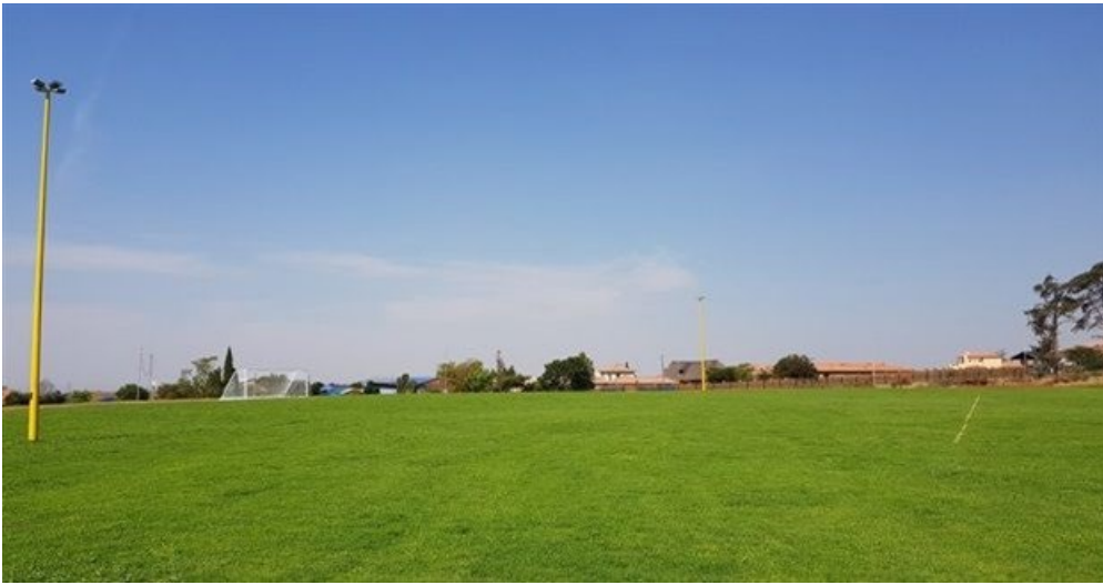
Soccer field after