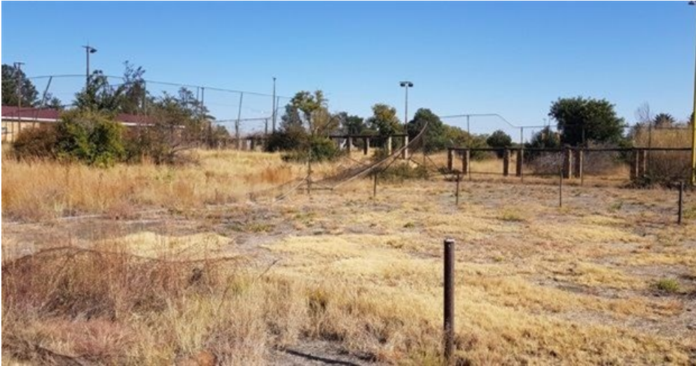
Tennis court before