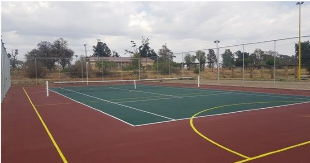
Tennis court after