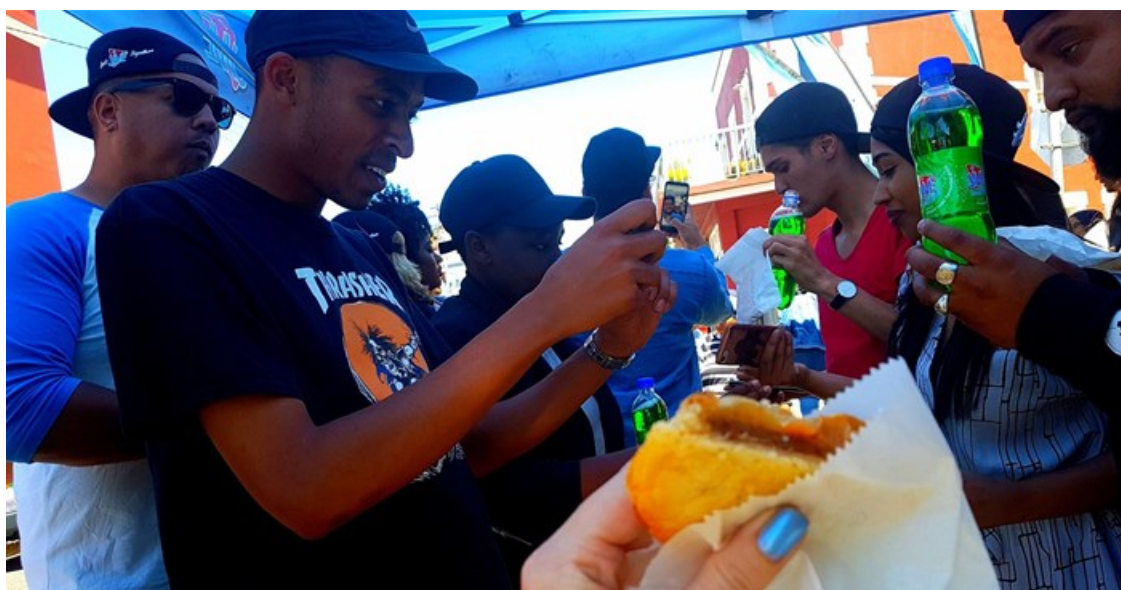
Everybody Instagramming the experience.

ne of day and pair especially well with Jive Cream Soda, which has a more-ish vanilla vibe that took many an influencer back to their early kiddies' party days.