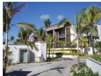
Long Beach has 255 keys, all with sea views, but try for the upper suite if you can, for an enhanced view.

Long Beach has 255 keys, all with sea views (but bear in mind the point I make above) and a beach that has been brought right up to the resort, and is a contemporary tropical 5-star resort for active guests who appreciate culture and style. It is also a very "family-friendly" hotel: while we were there during this visit there were a number of young families as guests - and the kids seemed to be enjoying themselves.