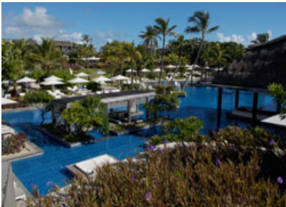
Feel like a dip? There are pools aplenty.

First of all, the service is unchanged - excellent.