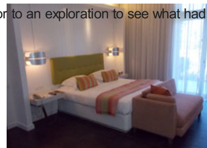
Very comfortable, great pillows, comfy bed...

Once in our suite, which was really comfortable and had bags of room, we settled in prior to an exploration to see what had changed and what had not. On our previous visit, management had provided us with a complementary bottle of rum, as the hotel staff knew we were celebrating 36 years of me being ordered about. This time... well, perhaps they reckoned that one bottle was enough.