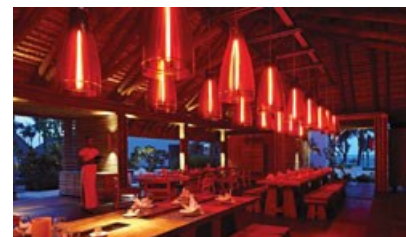
The food is excellent, but consider taking the full board option.

In fact, a check on TripAdvisor found comments overwhelmingly positive and rightly so, lauding Long Beach for its service, comfort, range of activities, food and so on, but a number of comments point to the cost of the drinks and, to some extent, the cost of the food.