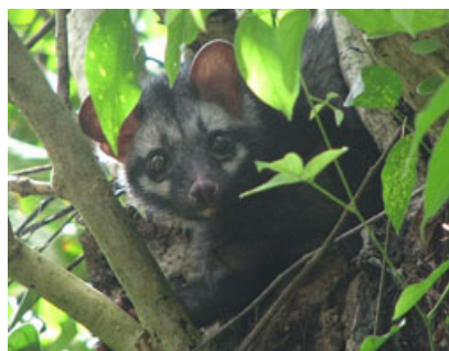
"Why, hello... You want some coffee? You'll need to wait awhile... but if you can't, don't worry, the coffee in your suite is really good"... A palm civet peers out of a tree in his home state of Kerala, India.