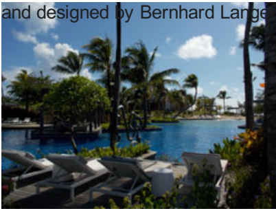
Pools for Afr... Mauritius, and plenty of loungers.

The Spa introduces what is claimed to be a first in beauty and health care rituals: Thali'sens and has 12 treatment rooms, including doubles. It is situated on the natural pond that was left in situ and offers a very wide range of treatments. So whatever your choice of pampering... the spa has it.