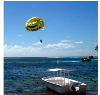
Honeymoon couples doing it as it should be done...

(You'll find a general overview and more about ( getting married in Mauritius here ) and more about getting married at Long Beach, specifically, here .