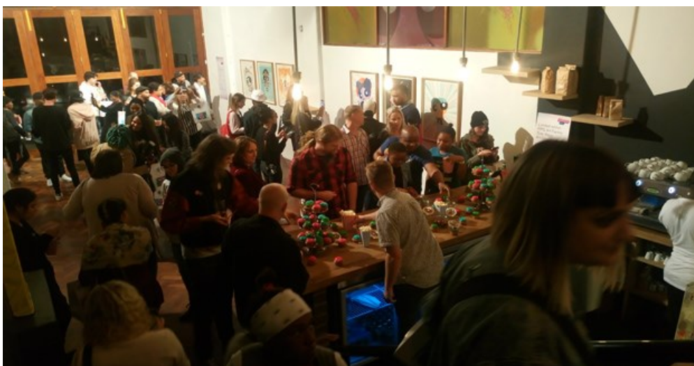
Guests at the launch event muse at the art while indulging their inner child.

To mark the opening of the exhibition, a special launch event was held at 91 Loop. Guests were welcomed by the Powerpuff Girls themselves and local girl power icon, Toya Delazy performed a few songs including her own version of Tacocat's theme song for the newest edition of the Powerpuff Girls series.