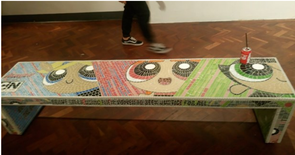
Rock Girl SA's Safe Spaces bench