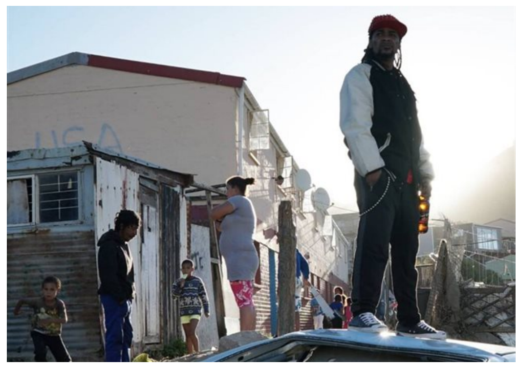
Mutant, winner of Best South African Feature-Length Documentary.

This year's annual Jozi Film Festival took place between 1 and 10 October, with limited physical screenings at The Bioscope, an on-demand digital platform for all 10 days, as well as free online screenings on each night of the festival, followed by live question-and-answer sessions.