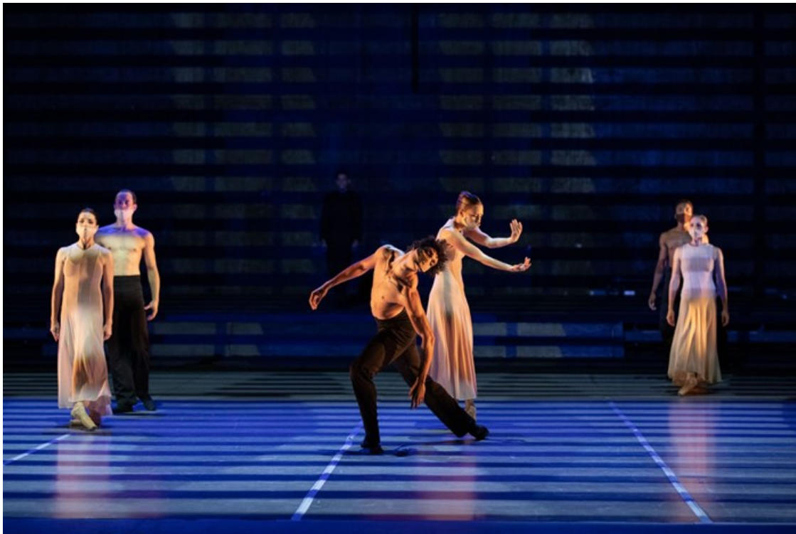
Cape Town City Ballet dancers in Moon Behind The Clouds