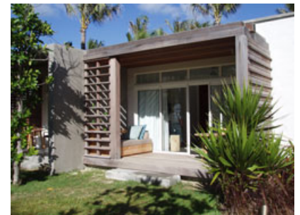
Our home from home during the trip.

For instance, the trend overseas is to now charge for tea or coffee in your room (we South Africans are used to paying for goodies from the mini bar, but this was a new one to me). So, for some packages at Long Beach that is the case, tea and coffee comes at a cost - given that the beverages are top drawer and to avoid any embarrassment, confirm what's "on the house" and what isn't when you book and/or book in.