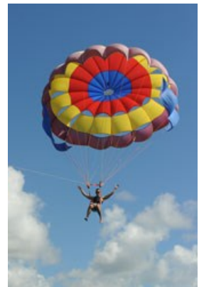
Look Ma, no hands.

So, when you spend a break at Long Beach, bear the above in mind... Having one of the many staff carry your plate from the buffet to your table is just part of the service.