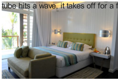
A room with a view. Well, every room has a view.

tube hits a wave, it takes off for a few metres and the occupants' legs fly into the air, accompanied by loud screams.