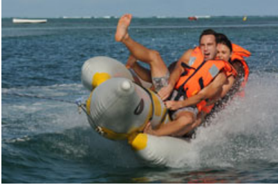
Come on, be one of the bunch - ride the banana.

Long Beach, Sun Resorts' new hotel development on the Belle Mare Peninsula, on the east coast of Mauritius, opened its doors to the media in early June to sample what has been designed to be a one-of-a-kind hotel for guests who have had the opportunity to stay there since it opened in April 2011. All pictures by Lettie Ferreira unless otherwise stated.