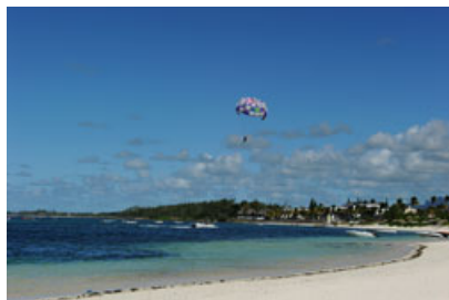
Just the spot to tan your bod - and an ever-present security guard keeps an eye on your possessions while you change colour.

But that's not all; for those who like an Oriental flavour to their stay (over and above Hasu, that is) try Chopsticks, the modern casual Chinese restaurant of Long Beach from which came some rather lip-smacking aromas - but then ambling through the Piazza ends up with you being assailed from all sides by aromas that will play havoc with any diet.