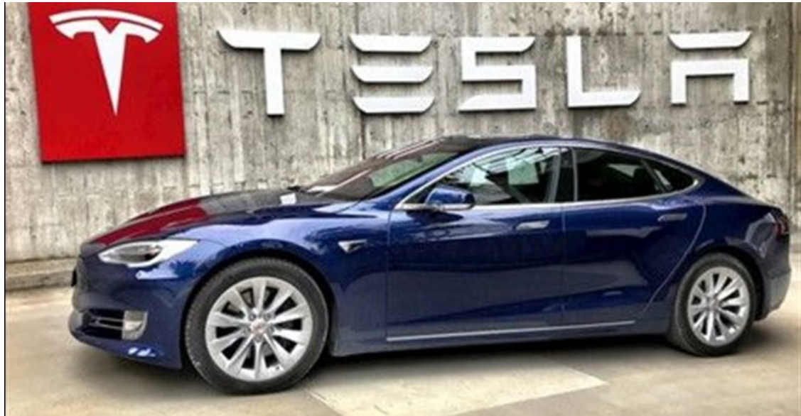
JD Power Tesla has a high Sustainability Perceptions Value but weaker CSRHub scores

Many of the world's largest brands have value at imminent risk if the sustainability perceptions of stakeholders are not aligned with sustainability performance.