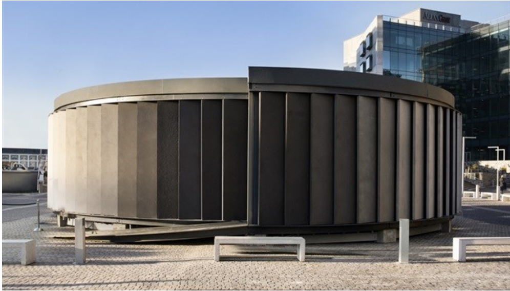
Zoetrope by Es Devlin. Image supplied.