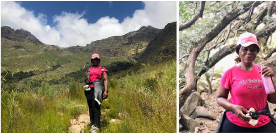
Professor Thuli Madonsela is in training for the Trek4Mandela 2019 expedition to summit Mount Kilimanjaro later this year.