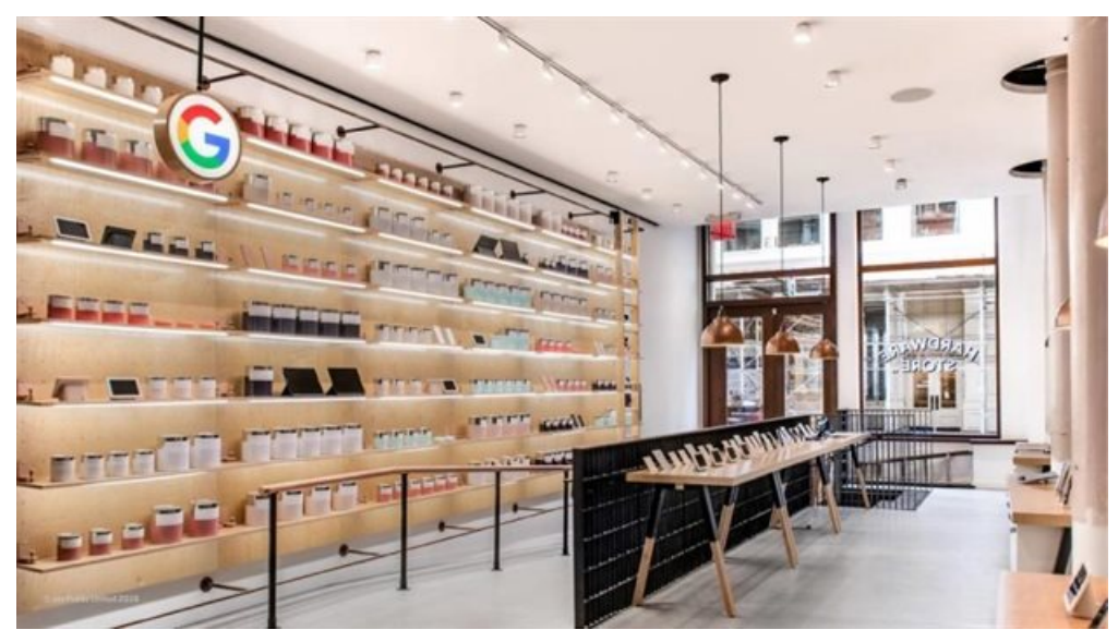
Joe Public United