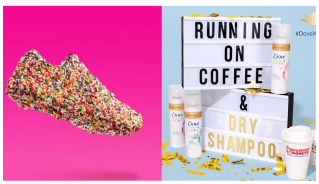
Joe Public United.

Another example of cross-functional collaborations, Keynerd showed us an international collaboration between Dunkin' Donuts and Dove. The brands paired up and hosted an activation on 1 October 2018 to celebrate women who always run on coffee and dry shampoo. Dunkin' Donuts also collaborated with Saucony and released a limited edition running shoe ahead of the Boston Marathon.