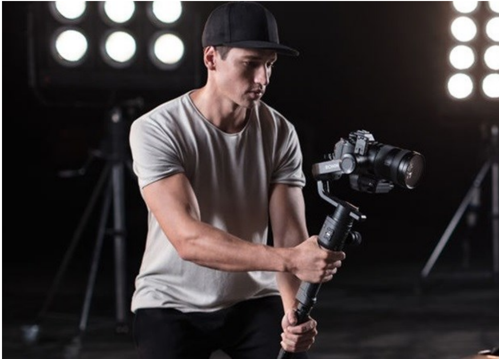
DJI Ronin-S.

On Saturday, 7 July 2018 Orms hosted a launch event, showcasing the latest in gimbal technology with the release of the DJI Ronin-S in SA. This new innovation is DJI's first single-handed stabiliser promising professional quality.