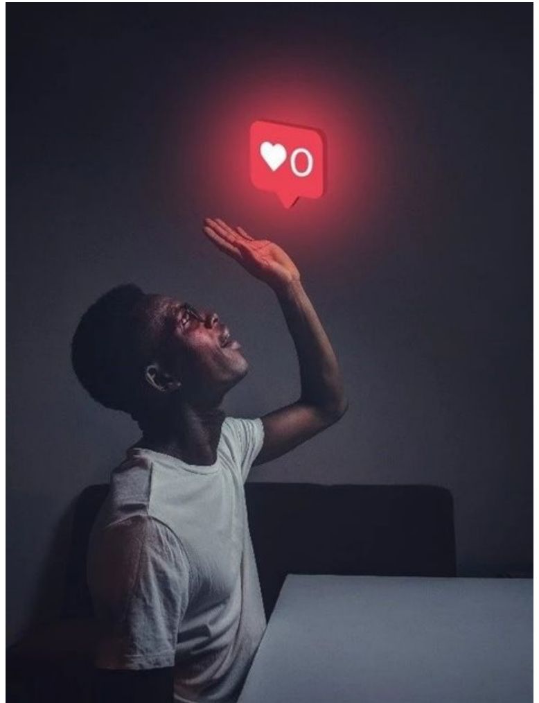
We all want likes and followers on Instagram, but how are we using our bios to drive our business objectives?

Here is the clincher: Unlike competitors that offer a one-size-fits-all solution, V5 Digital builds a custom solution for you based on our thorough understanding of your business and your needs. Whereas competitors' offerings will click from the link in your bio to a bland screen with multiple clickable links, V5 Digital's offering clicks through to a screen that we tailor to match the look-and-feel of your brand. We include social icons so your audiences on your other social accounts can grow and cross-pollinate. Instead of copy-heavy link buttons, V5 Digital uses visual representations of your content that are clickable, transporting your audience to exactly where you need them to be.