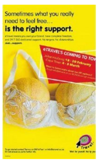
The eTravel ad.

And, if that is the case, you pick up an Onion.