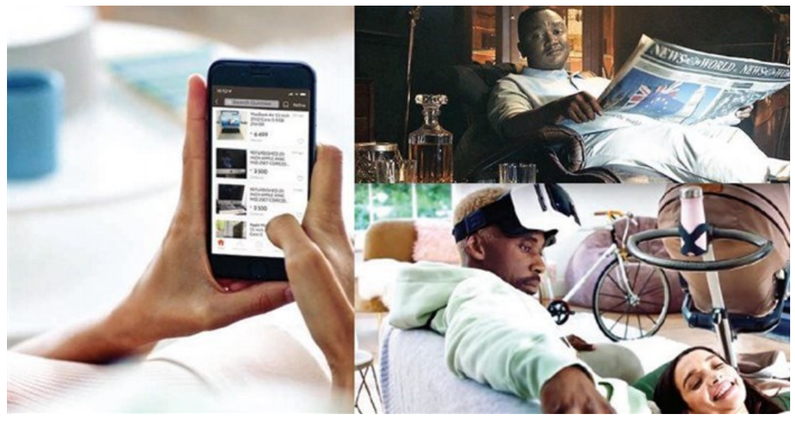
Screengrabs from the Gumtree ad.

Latest ads take a jab at current generation's obsession with celebs, stuff and Fomo.