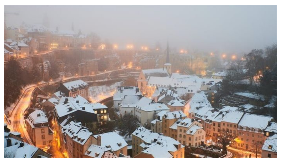
Making heating and lighting energy efficient has long been a priority.

In September, a <u>report</u> published by the Royal Academy of Engineering drew further attention to the environmental costs that the industry incurs and possible ways to address them. Central to this new way of thinking about construction is what architects and developers call a <u>whole-life carbon approach</u>.