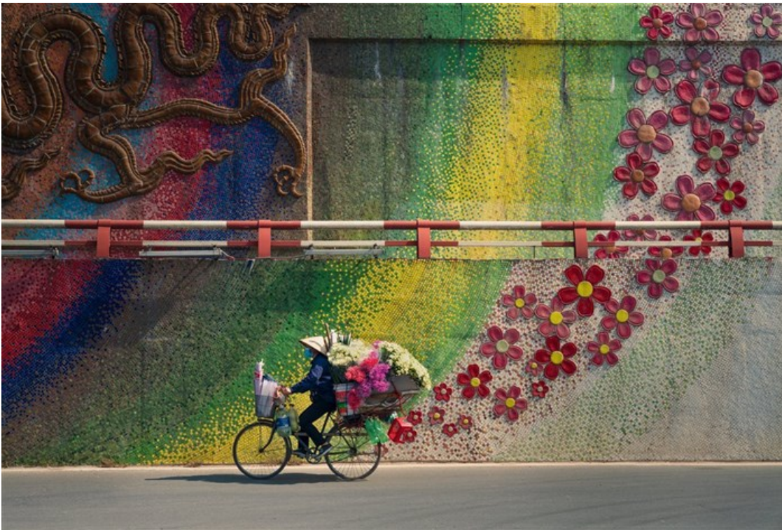
Bike with Flowers by Nguyen Phuc Thanh

Nguyen Phuc Thanh, Vietnam (Vietnam) for Bike with Flowers , an image depicting a traditional flower street seller cycling in Hanoi, Vietnam. The bike has been shot just as it passes a wall bursting with flower decorations, giving the appearance that they are spilling from the rider's baskets.