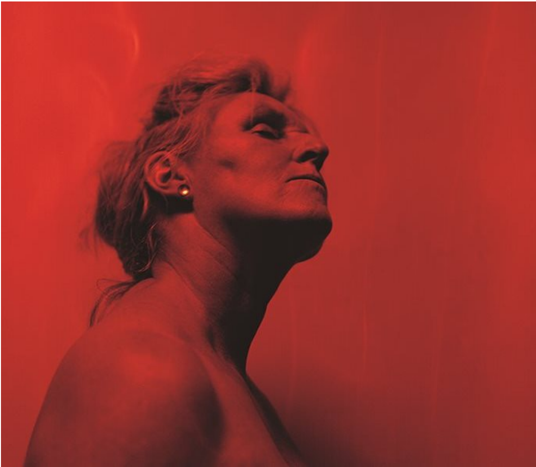
Untitled by Isabel Salmon

Vicente Ansola (Spain) for Exodus , an evocative image of a field of wilted sunflowers dried out by the beating sun in Castilla León. The photographer’s imagination was caught by the proud stature of the flowers, recalling for him the rural past of Spain, and the women who worked the arid fields of Castilla.