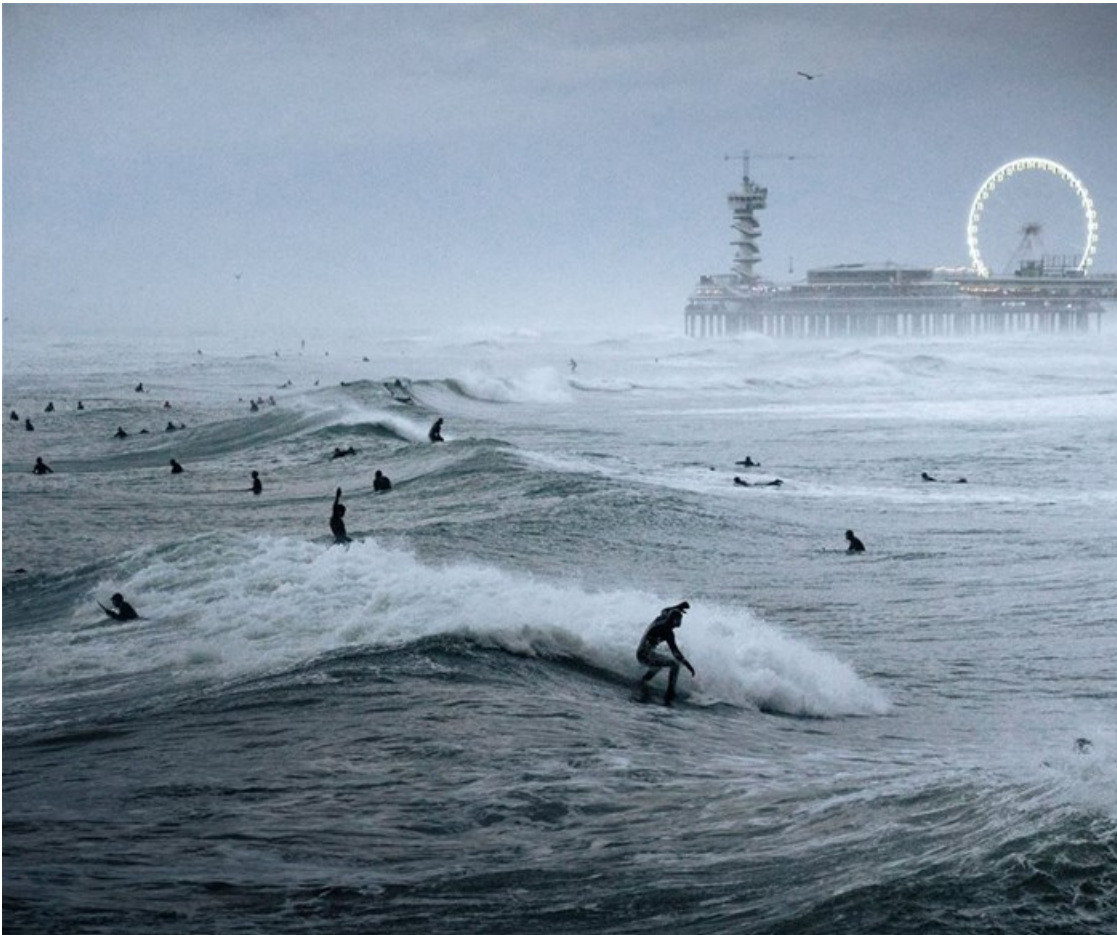
Surfing Festival