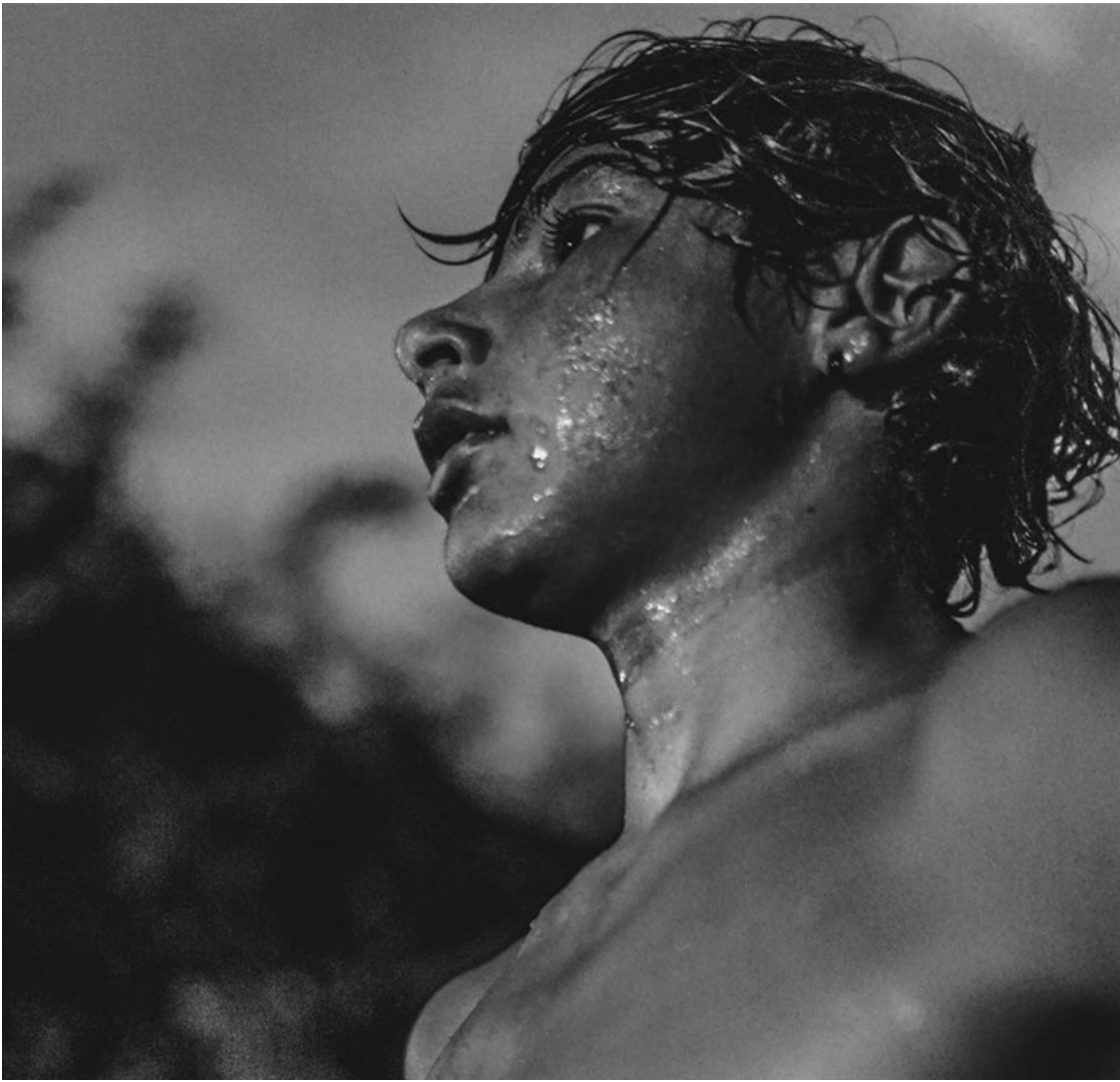
The Endless Summer - Surf Trip by Simone Corallini