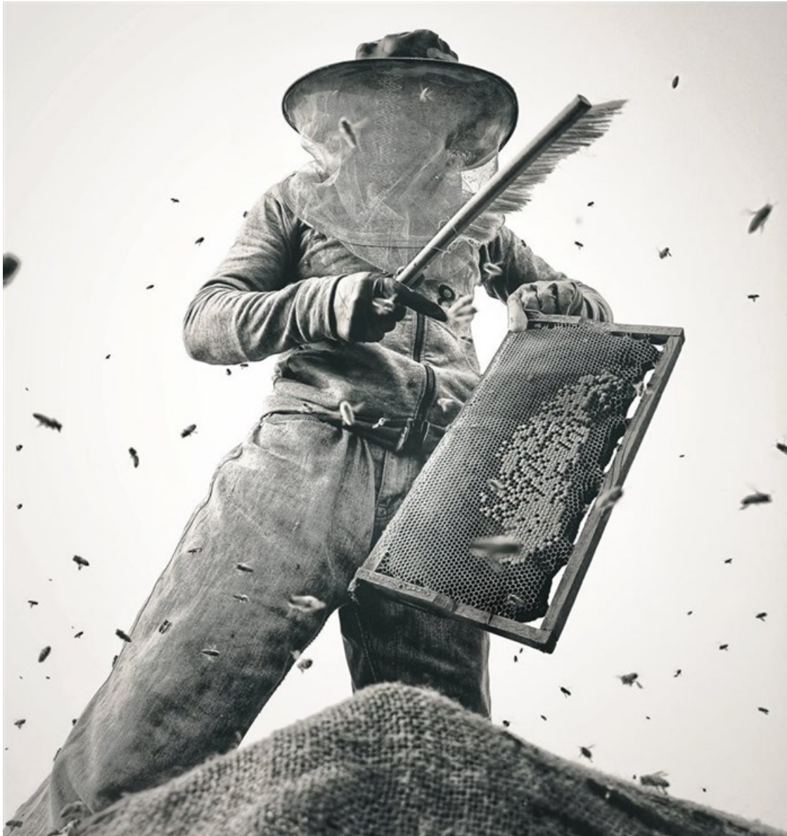
The Honey Collector by Utsab Ahamed Akash

Utsab Ahamed Akash (Bangladesh) for The Honey Collector , capturing a honey collector from below as they inspect a tray of honeycomb. In a typical countryside scene in Bangladesh, honey collectors place bees' nests near mustard fields and collect the honey in winter.