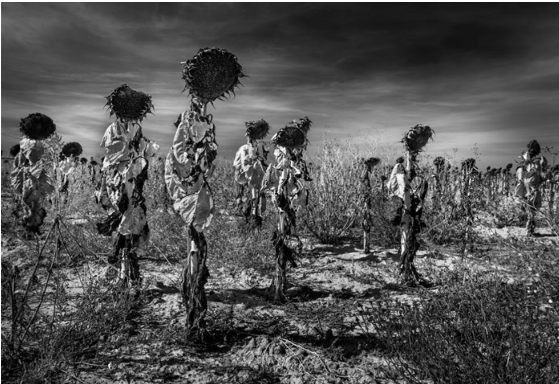
Exodus by Vicente Ansola

Vicente Ansola (Spain) for Exodus , an evocative image of a field of wilted sunflowers dried out by the beating sun in Castilla León. The photographer’s imagination was caught by the proud stature of the flowers, recalling for him the rural past of Spain, and the women who worked the arid fields of Castilla.