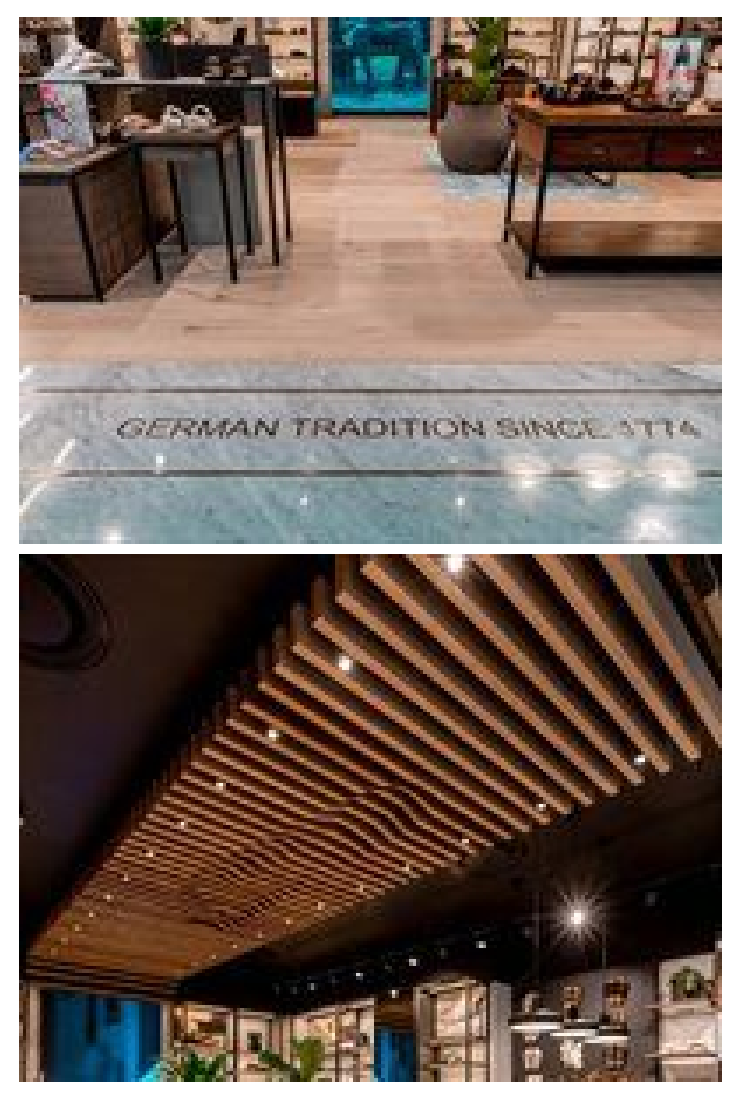
Birkenstock's connection to nature is reflected in the store's natural interior design and earthy colours. Its natural materials are highlighted by cork, jute and leather decor.

For more, visit: https://www.bizcommunity.com