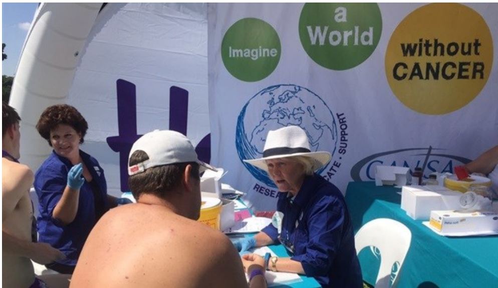
Advice and information aplenty.

However, the exponential growth in media coverage of men's cancer during the build-up to the run and afterwards has been one of the most exciting aspects of the run. The South African media deserve a huge amount of credit for the way that they have taken the messages behind the run to heart, and for all of the assistance they have provided in ensuring those messages are heard. Through the media, the number of people that have seen messages about how and when to test for testicular and prostate cancer has grown more than a hundred-fold since the run started.