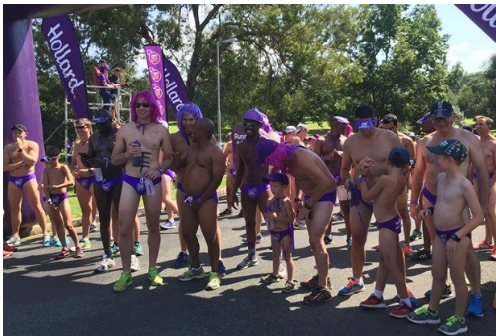
Get ready, set, go!

Balona: I love that the run attracts men from all walks of life, and of all shapes and sizes, and is not limited to only good looking men in good shape. I've also seen fathers arrive with their sons to take part, which shows that we're getting the right health messaging across to family members, too. This is valuable, as the cancer risk is higher if a family member has been diagnosed with cancer. It's also great to see so many women on the side lines showing support for their men, who are taking part.