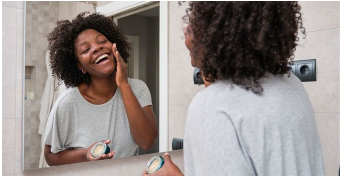
Sustainability is growing rapidly in significance and its importance is extremely high in the cosmetics sector

Sustainability is growing rapidly in significance and its importance is extremely high in the cosmetic sector relative to other sectors.