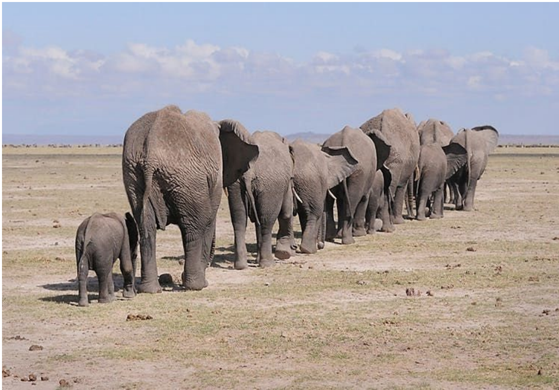
Ain't complaining: elephants in Amboseli national park.

The government is providing some financial support to industry workers through an economic stimulus programme . It has also mobilised tourism-association leaders into a taskforce to oversee reopenings.