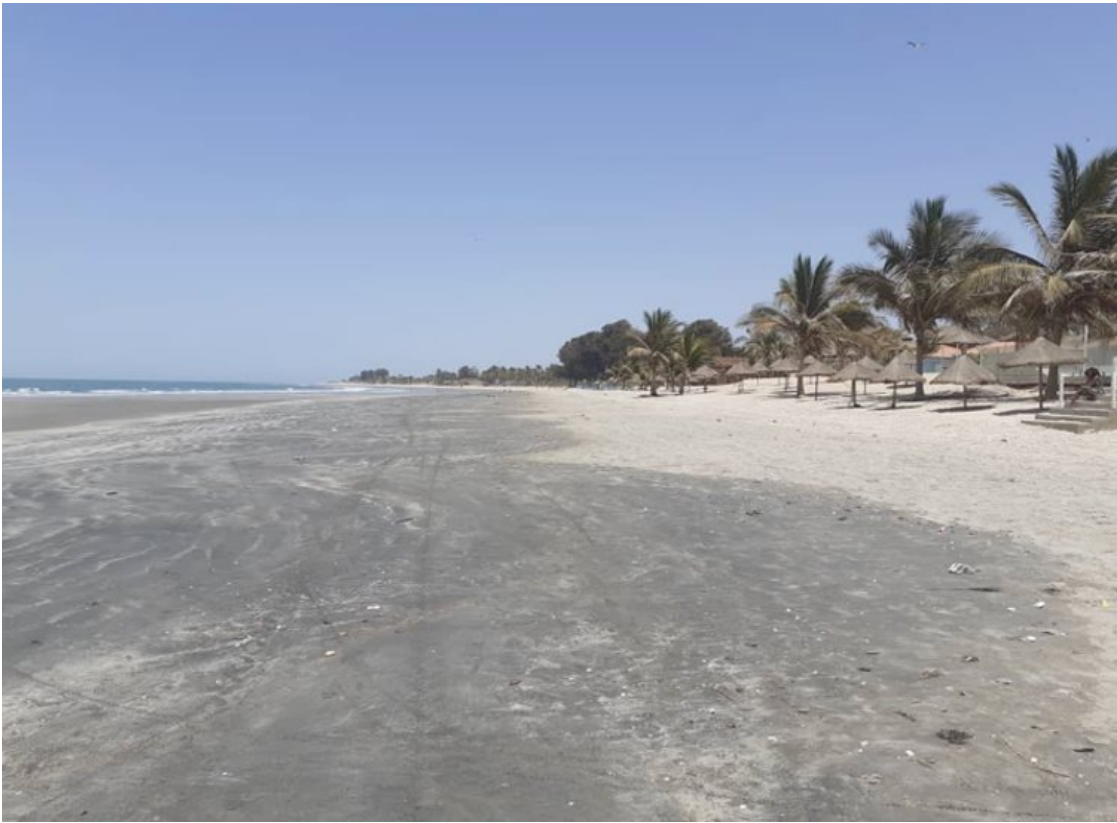
Normally packed with tourists, the Gambia's most popular tourist beach at Kololi Beach is empty.

In both countries, the emphasis during the crisis has been on collaboration. But this needs to happen internationally, too, since neither has the "fiscal space" for the economic stimulus seen in advanced economies. A Mandinka proverb says that "rice fields with the same borders share the same waters". We're all in this together, in other words.