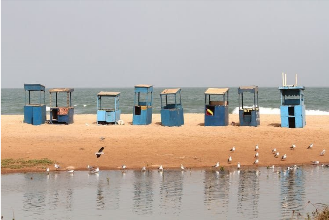
On Bijilo Beach in the Gambia, there are no fruit sellers in sight.

In the Gambia, teams of young tourism guides in their first holiday season are doing something very different from what they learned in training. They have been redeployed to act as coronavirus guides for their local communities, raising awareness and explaining to their fellow Gambians how to prevent the spread of infection.