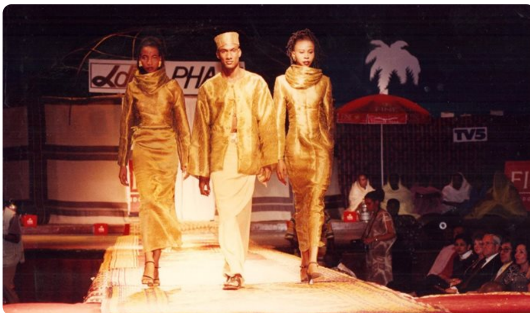
Alphadi, Catwalk Image, c.1992-3

The “simple” take by early colonialists on African dress – or lack of it as they saw it – fuelled the dismissal of the African continent as unsophisticated or unqualified to offer fashion for decades. This thinking was yet another form of “othering” that grew from the imagery and language perpetrated to “sell” slavery. Colonialists portrayed Africans as uncivilised and different to European people and culture, thereby dehumanising the African continent.