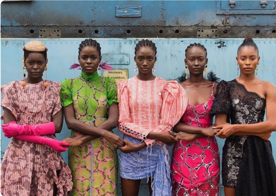
Models holding hands, Lagos, Nigeria, 2019 by Stephen Tayo. Courtesy Lagos Fashion Week. Source: V&A

A landmark show has recently opened its doors at the V&A in London, where exhibitions celebrating fashion and design from around the world have omitted the continent of Africa for years. In fact nearly 200 years. For the first time in its 170-year history, the V&A is holding an exhibition that centres solely on African fashion.