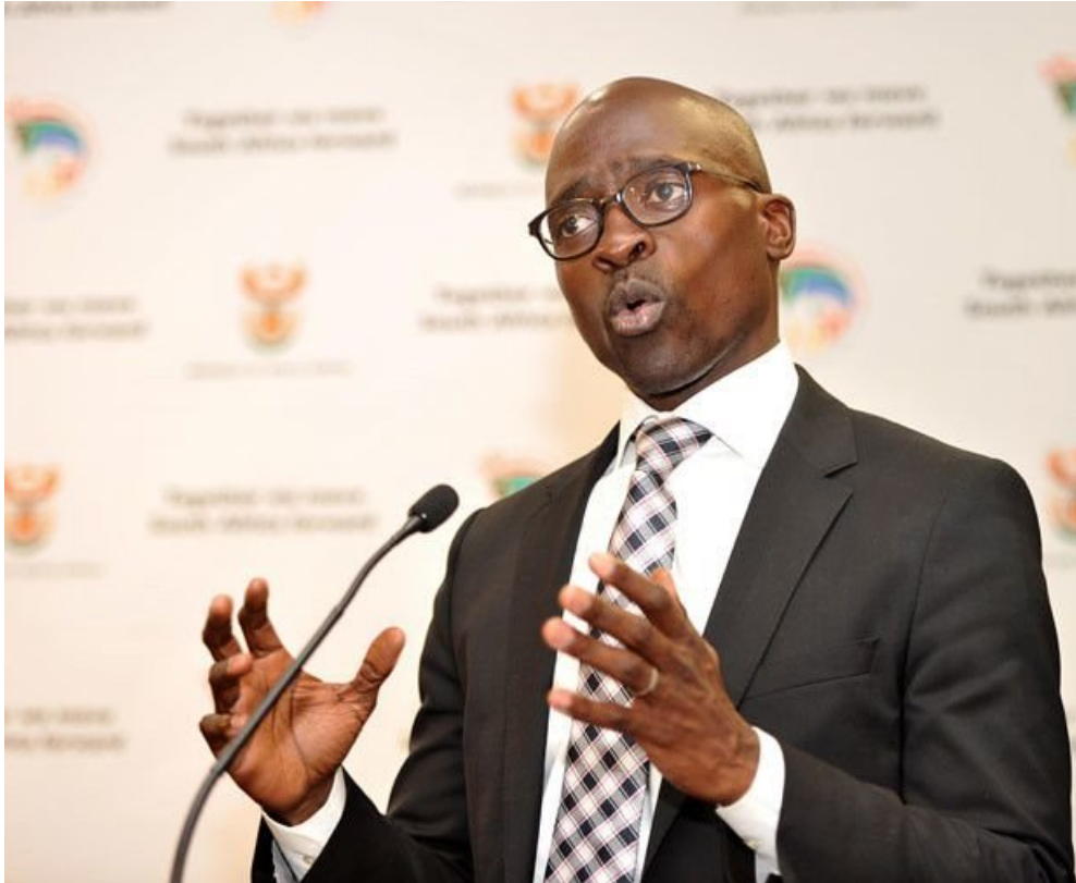
Malusi Gigaba

Despite his many refutations to allegations that he interfered in the operations of state-owned entities under his watch as minister of public enterprises between 2010 and 2014, Malusi Gigaba did in fact interfere in Eskom's business dealings with Gupta-owned TNA Media. This is according to the state capture commission's chairperson, Acting Chief Justice Raymond Zondo.