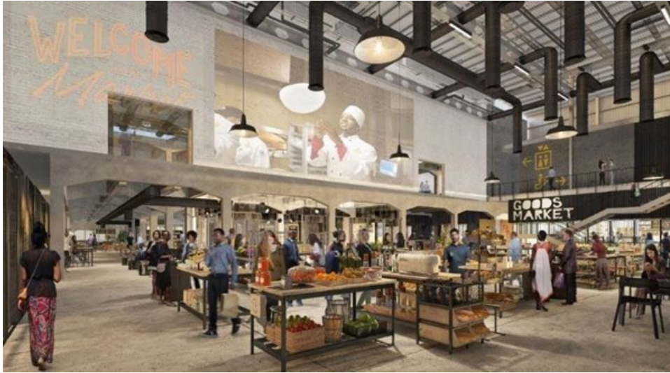
Artist's impression of what Makers Landing will look like once development has completed end of 2020.

The V&A Waterfront is pushing ahead with its plan to develop Makers Landing, a local food destination comprising a business incubator and food emporium focused on SA flavours and culture. The project is the result of a R63m investment made in partnership with the National Treasury's Jobs Fund to create opportunities for food talent within a new, 360° farm-to-fork food experience.