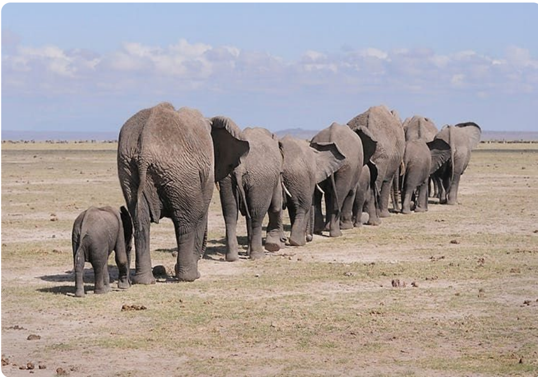
Ain't complaining: elephants in Amboseli national park.

The government is providing some financial support to industry workers through an economic stimulus programme . It has also mobilised tourism-association leaders into a taskforce to oversee reopenings.