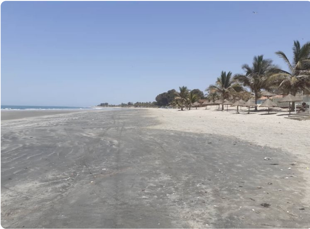
Normally packed with tourists, the Gambia's most popular tourist beach at Kololi Beach is empty.

In both countries, the emphasis during the crisis has been on collaboration. But this needs to happen internationally, too, since neither has the "fiscal space" for the economic stimulus seen in advanced economies. A Mandinka proverb says that "rice fields with the same borders share the same waters". We're all in this together, in other words.