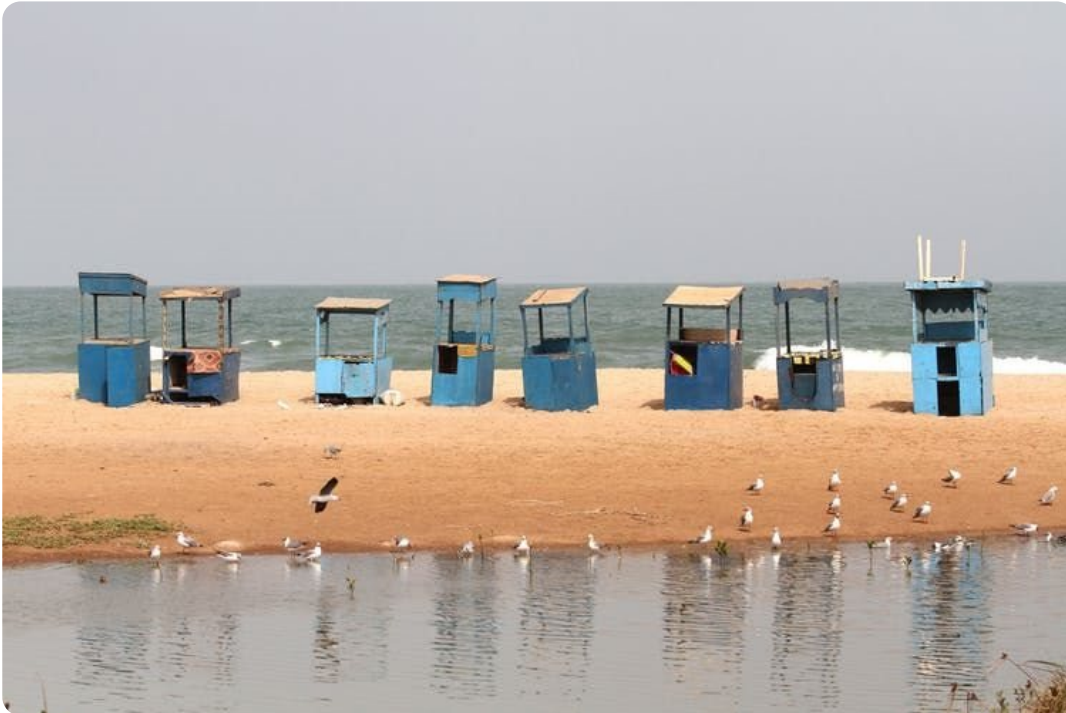
On Bijilo Beach in the Gambia, there are no fruit sellers in sight.