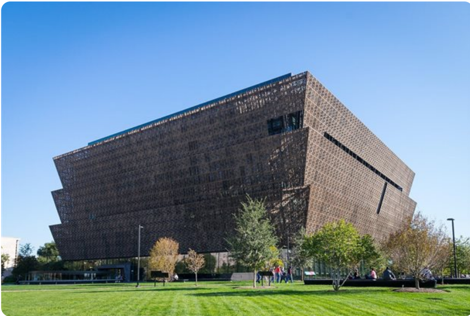
David Adjaye's Smithsonian National Museum of African American History and Culture in Washington DC.

Both structures have added nuanced cultural expression to their respective cities, and both highlight that, given the diversity and cultural depth within Africa, there can be no single definition of African architecture. What African countries do share, however, is a colonial history, a struggle to emerge from that yoke and a desire to assert themselves.