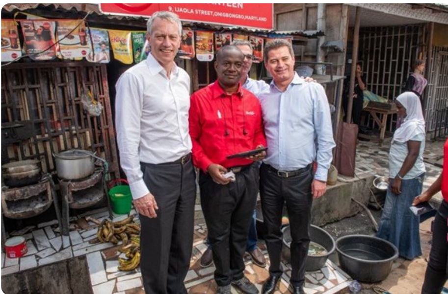
James Quincey, chairman and CEO at The Coca-Cola Company, a Nigeria Bottling Company sales representative and Zoran Bogdanovic, Coca-Cola Hellenic CEO during a market visit at Maryland in Lagos.

"It is clear that Africa is indeed a region that will increasingly influence the growth trajectory of global businesses and we have taken some bold measures to strengthen the Coca-Cola System in Africa for long-term growth, enhancing our capacity to continue to win in the continent's increasingly competitive landscape."