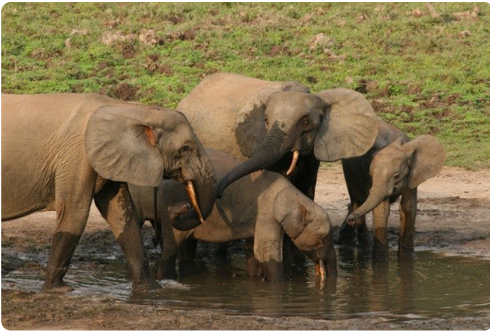
Forest elephants.

These sensors capture the soundscape in Nouabalé-Ndoki National Park and adjacent logging areas: chimpanzees, gorillas, forest buffalo, endangered African grey parrots, fruit hitting the ground, blood-sucking insects, chainsaws, engines, human voices, gunshots. But researchers and local land managers who place them there are listening for one sound in particular — the calls of elusive forest elephants.