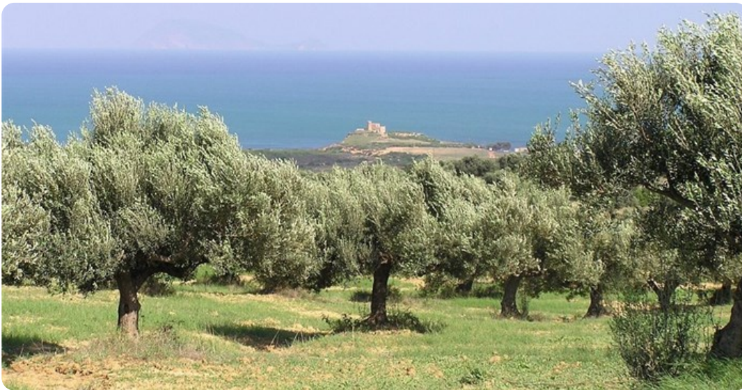
Nicholas.gosse via Wikimedia Commons - Olive tree plantation in Tunisia. Olive oil is Tunisia's largest agricultural export.

Finding enough to eat has been an ages-old challenge for Africans. Against a physical environment often hostile to agricultural and pastoral activity - deserts, mountains and dense forests - the population explosion of the past century has made the goal of food security an even more difficult accomplishment. More and more people compete for a finite amount of agricultural production. However, political will by governments to prioritise food security, combined with the use of new crop and food production technologies, has allowed some countries to break the chains of food insecurity.