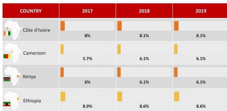
WORLD BANK REAL GDP GROWTH FORECASTS

Global Economic Prospects, Weak Investment in Uncertain Times, 2017, World Bank