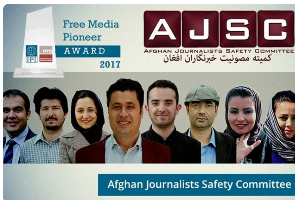
Afghan Journalists Safety Committee

organisations that have made innovations that have promoted news access or quality, or benefitted journalists and the media community, thereby ensuring freer and more independent media in their country region.