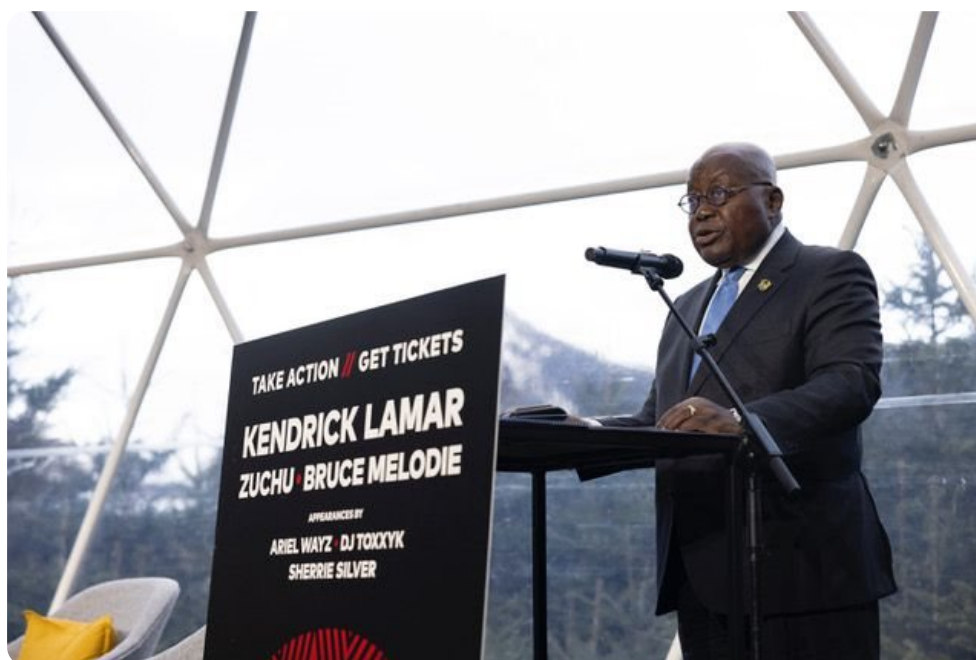
His Excellency, President Nana Akufo-Addo addresses the audience at the World Economic Forum in Davos inside the Forbes Dome during the announcement of the Ghana partnership with Move Afrika: A Global Citizen Experience.

Over time, these events will increase demand from international and regional artists to tour the region, and build local capacity, create jobs and scale the live entertainment sector within host cities.