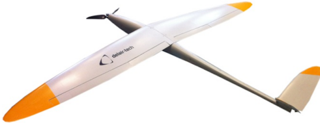
Delairtech DT18 Fixed Wing Drone.

We're testing a fixed-wing drone, DT18; it is produced by Delairtech, a French company. This type of drone is suitable for covering long distances – which is necessary when you're mapping large areas' property boundaries.