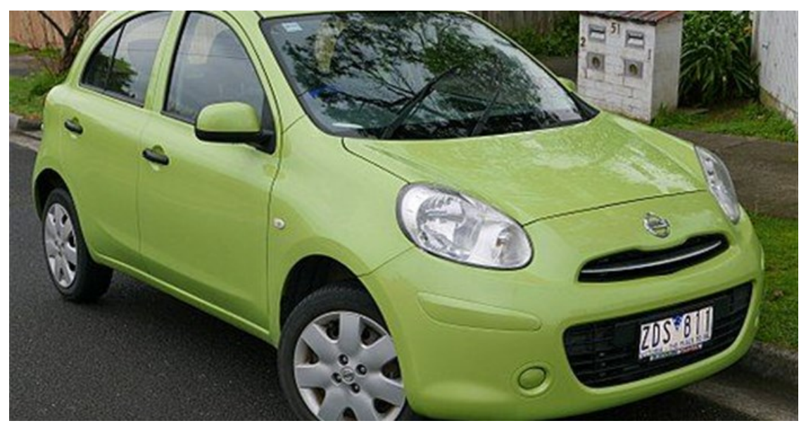
Old bubble shape.

These elements, along with the rest of the car's carefully considered exterior design, gives it a bold, athletic look - as if it's ready to take on any challenge. It might not be able to take on any challenge, but it will sure give it a good go.