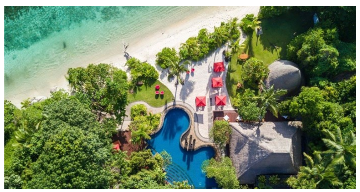
MAIA Luxury Resort & Spa aerial view

The TripAdvisor Certificate of Excellence celebrates hospitality businesses that have earned great traveler reviews on TripAdvisor globally over the past year. This year, 66 Certificate of Excellence awards were presented to a total of 66 Tsogo Sun properties in 36 regions across nine provinces and seven countries. 11 Tsogo Sun hotels and resorts have also won 2017 TripAdvisor Travelers Choice Awards.