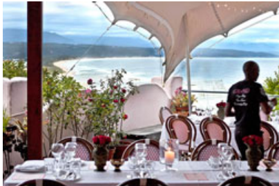
All the view you could want.

It takes a special kind of visionary to turn a decrepit piece of real estate into a boutique hotel that is recommended by trendy and upscale group Mr and Mrs Smith.