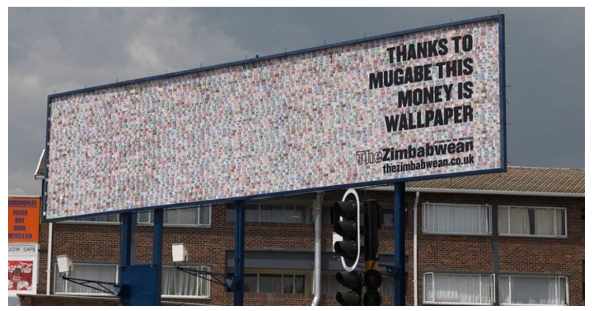
Source: Creative Criminals <u>Creative Criminals</u> TBWA used worthless high denomination Zimbabwe currency as the materials in billboards, murals, posters and flyers in protest to the policy of Robert Mugabe, because it had an negative impact to the country's economy

In 2010 it was named Agency of the Decade 2010. Its work for the The Zimbabwean Newspaper was also the most awarded campaign of all time in the same year, winning at Cannes, The One Show, Clio's, ADC and D&AD.