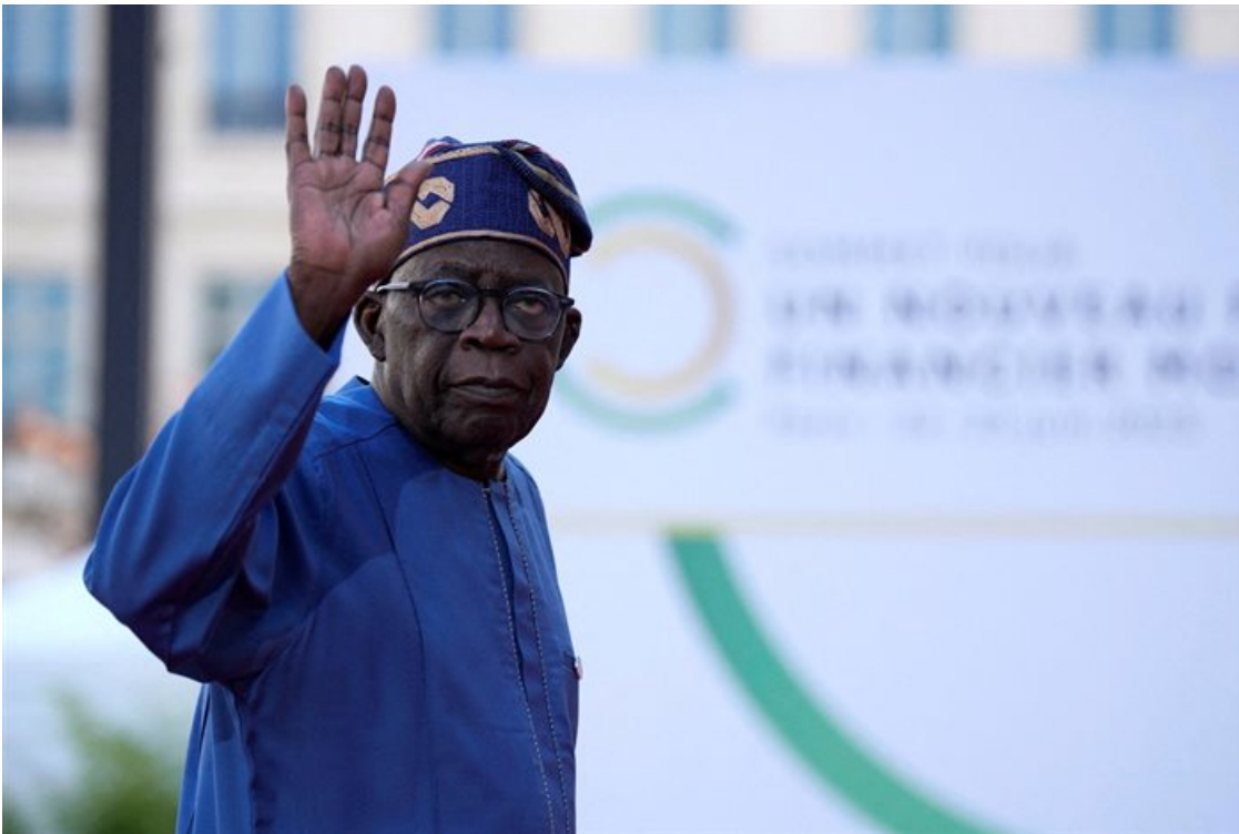
Bola Tinubu, president of Nigeria, at the New Global Financial Pact Summit. 2023.

Nigeria's President Bola Tinubu on Friday, 21 July, announced the creation of a new infrastructure fund, part of a series of measures to boost the economy and ease the inflationary impact of his decision to scrap an expensive petrol subsidy.