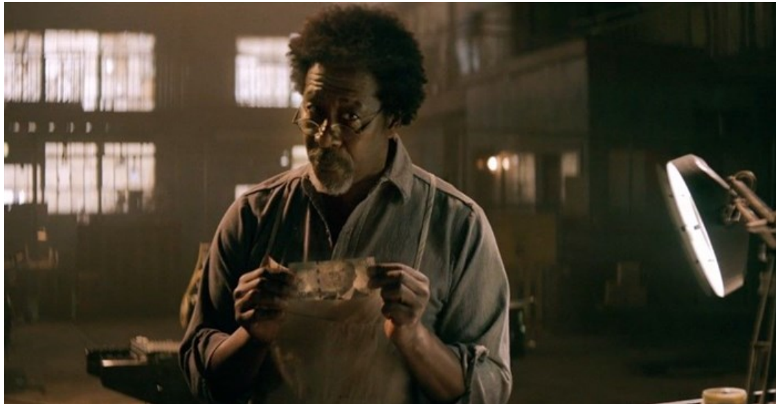
Nedbank's A Tale of Note TVC- Joe Public.

The Midas Awards for the World's Best Financial Advertising has announced its 2017 winners and South Africa has struck gold with 12 Midas Gold Ingots in the bag.