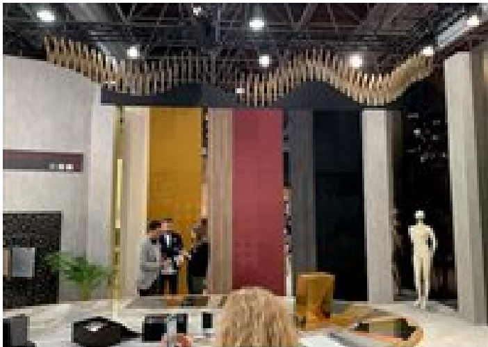
Interesting textures and engaging product demonstrations.