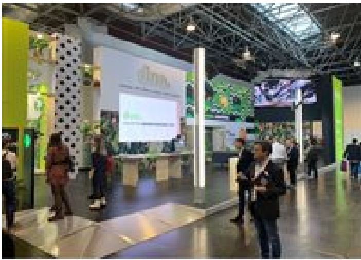
Extensive use of video screens of different sizes.