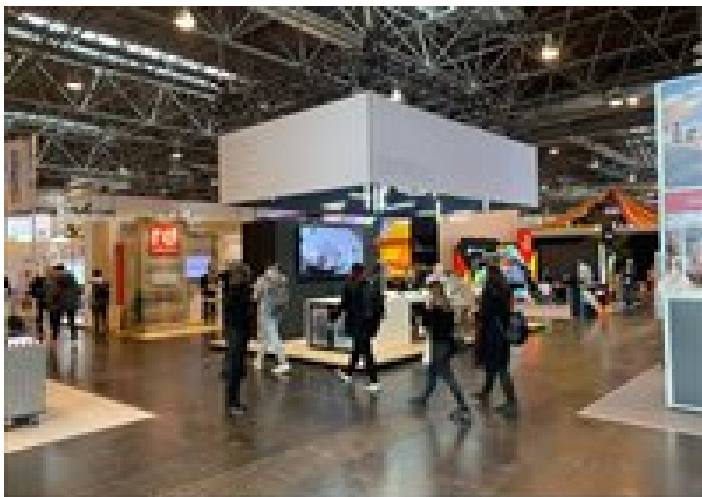
Screen on the back wall is streaming the person drawing at the counter.