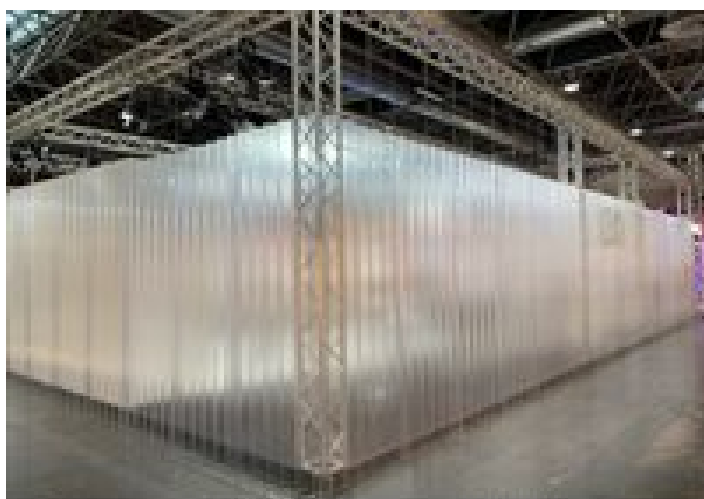
Semi-transparent materials, showing movement and activity inside stand.