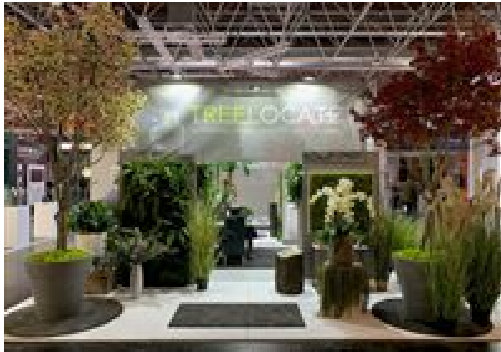
Realistic, re-usable, maintenance-free artificial plants for exhibitions.

The Scan Display team shares a selection of expo stand trends as seen on Day 2 of the EuroShop trade fair in Düsseldorf, Germany. Exhibition stand designers and builders use their own expo stands to showcase their work and experiment with the latest design trends. This makes EuroShop the perfect place to see what's new in the exhibition industry.