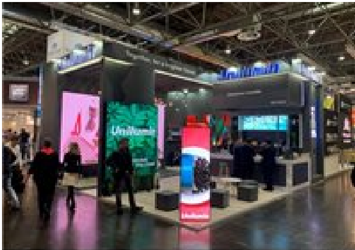
Screens, screens and more screens.