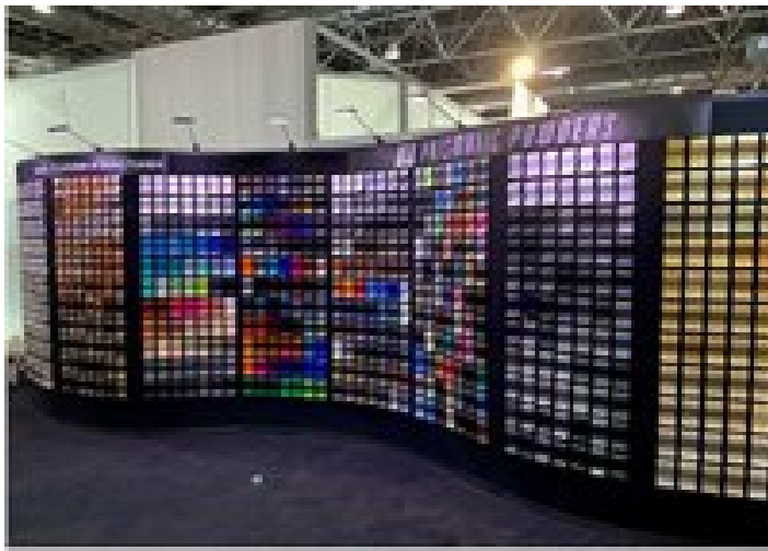
Extensive range of powder coating colours for brand matching.