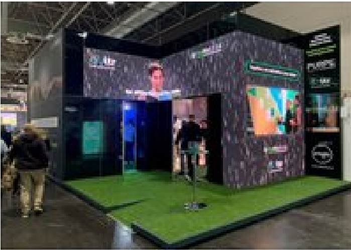
More screens than walls.