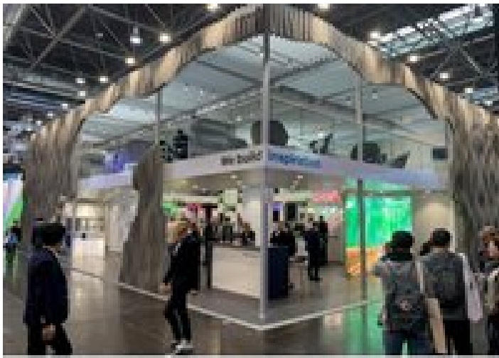
Oceanform stand with interesting substrates cladding the framework.