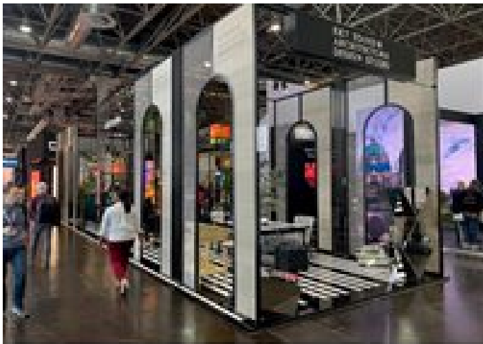
Showcasing different materials, textures and an eclectic interior.