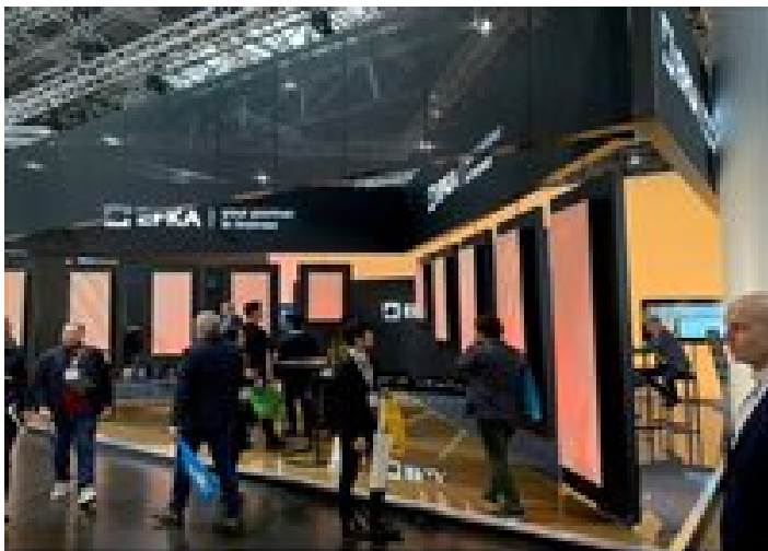
Extensive use of LED screens with imaging creating an evocative mood.