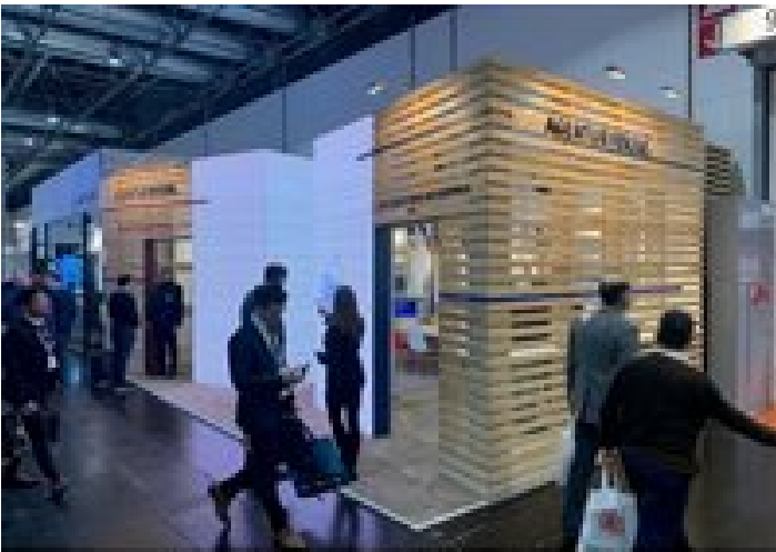
Raw wood combined with large LED screens.

At the last EuroShop show three years ago, the biggest trend was the use of large format fabric graphics. At EuroShop 2020, it's evident that the large format graphics have evolved into an electronic display format. Large LED screens are dominating the stand architecture. They are sometimes still being used in combination with large backlit fabric graphics but the dynamic content presented on LED screens makes them more popular.