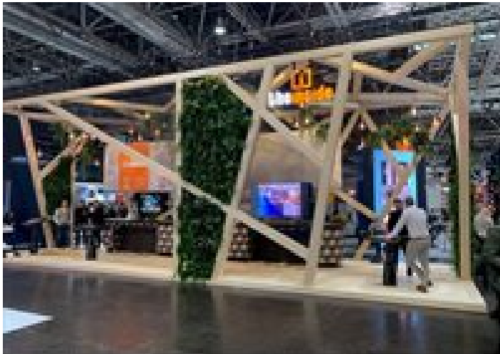
Wooden structure creating a stand with a sustainable message.