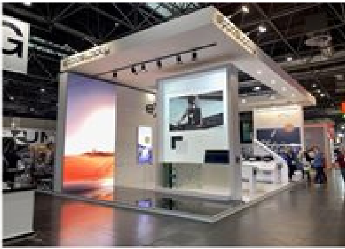
More screens than walls.