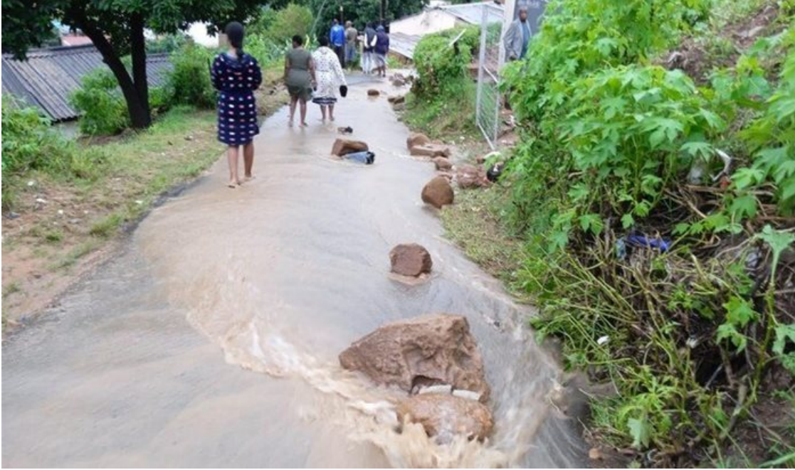
Residents monitor the situation along Mayahe Walk in Ntuzuma H, north of Durban. Stones and sand block the street.