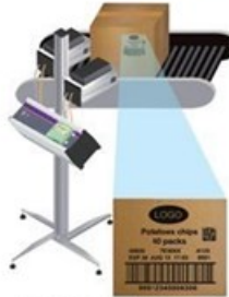
LARGE CHARACTER INKJET