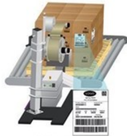
PRINT AND APPLY