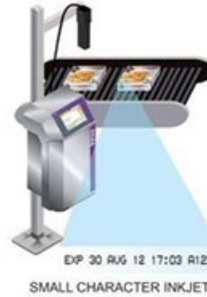
SMALL CHARACTER INKJET