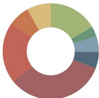
Projected mobile network operator revenue from A2P RCS traffic in 2025.

A2P messaging, which involves sending texts from a business-operated software application to a consumer's device, is emerging as a game-changer in the digital communication landscape.